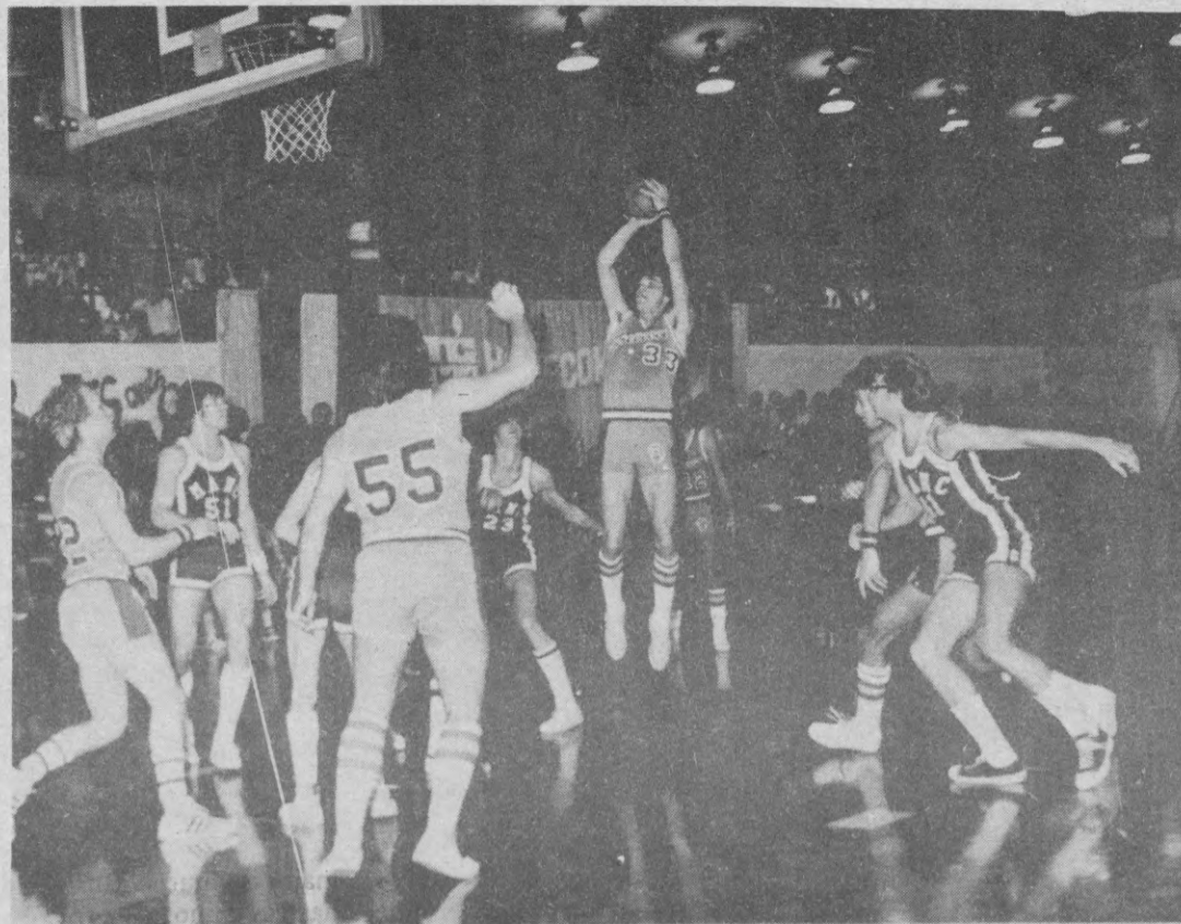
Trevecca downed Mid-America in last years Homecoming game. Will we repeat against Bryan?