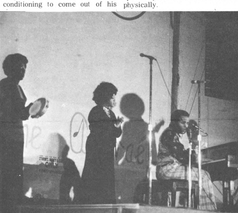
Pictured here is Andrae Crouch & the Disciples at TBA's April 30th Concert