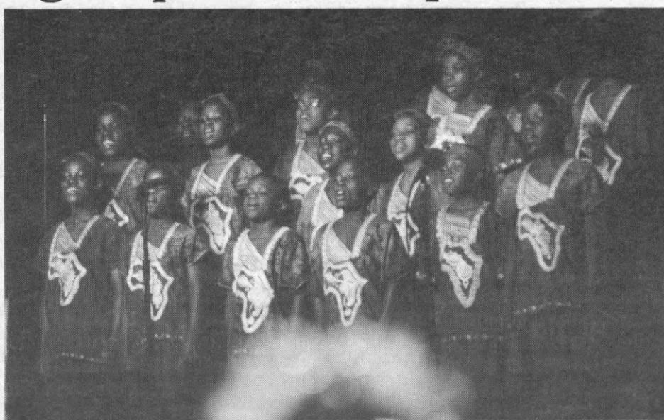
The African Children's Choir shared their voices and smiles with Trevecca