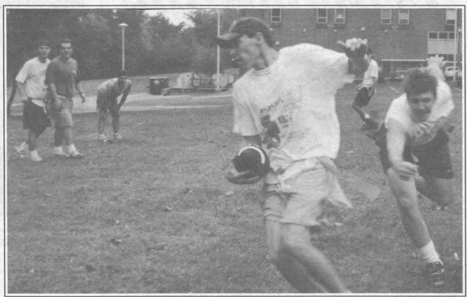
TIA men's football had a good season this fall.