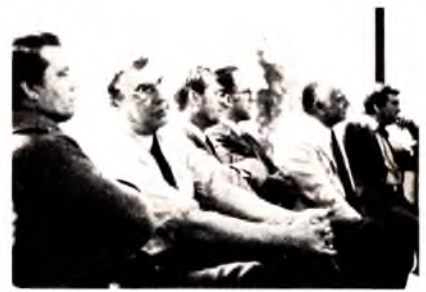
A group of pastors listen intently to one of the presentations at the Church Planter Seminar June 11-15 at British Isles Nazarene College.

Following in-depth discussions each morning of the biblical basis for church growth, Dr. Hurn led the group through several detailed stages of planning. This included the listing of known facts and assumptions that can be drawn from these facts. The assumptions were listed in priority order relating to church growth.