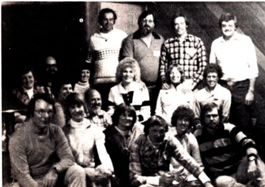
The couples at the marriage enrichment retreat for Nampa, Ida., First Church.