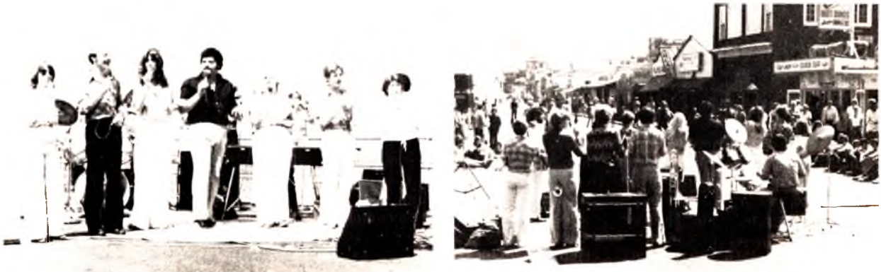
Discovery in concert