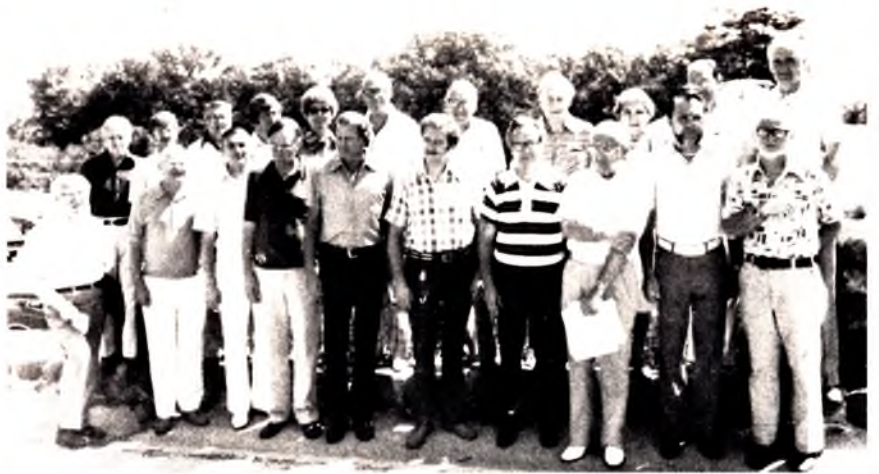
Members of the Curriculum Committee.

Begins with the September/October/November, 1979, Quarter