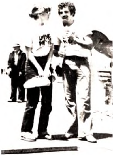
Living Word presents skit

The summer ministry of Discovery and Living Word continues through August. □