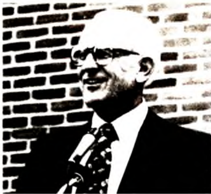
President Nees of Mount Vernon announces the reaffirmation of accreditation.

This action followed the recommendation of the examining team of North Central that had reviewed the total operation of the college in March, and is the maximum period allowed between reviews. This feat was achieved after having graduated only four bac-