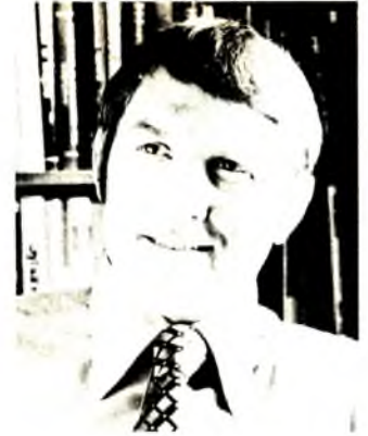
Dr. James Dobson, Jr.