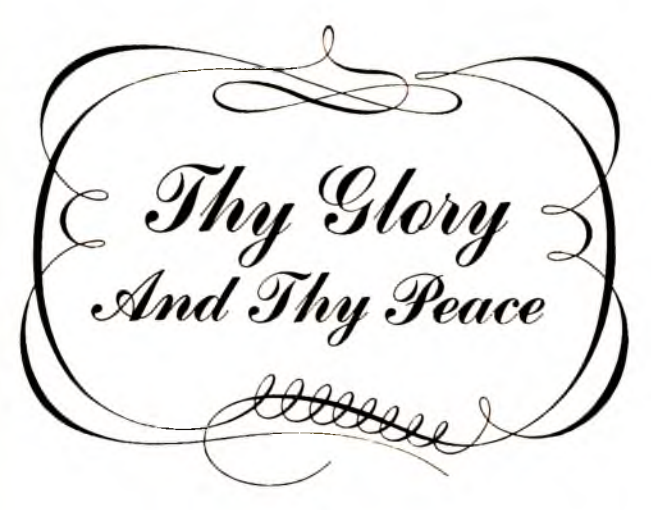
By GRACE NOLL CROWELL

The world of mankind was shrouded in a veil of darkness that was exceeded only by despair itself. The favored were rich and rotten, while the poor were paupers in spirit as well as substance. The greed of a corrupt partisan leadership had risen to new heights of graft and pseudo-power, while the "commoner" was denied even the ordinary rights of citizenship. Taxation was oppressive and tax collectors waxed richer, while the taxed became poorer.