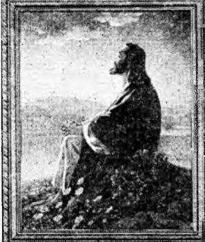
CHRIST AT DAWN $3.95 Style