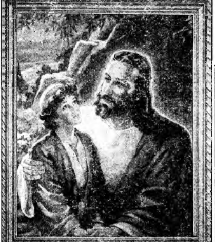
TEACH ME THY WAY $6.95 Style