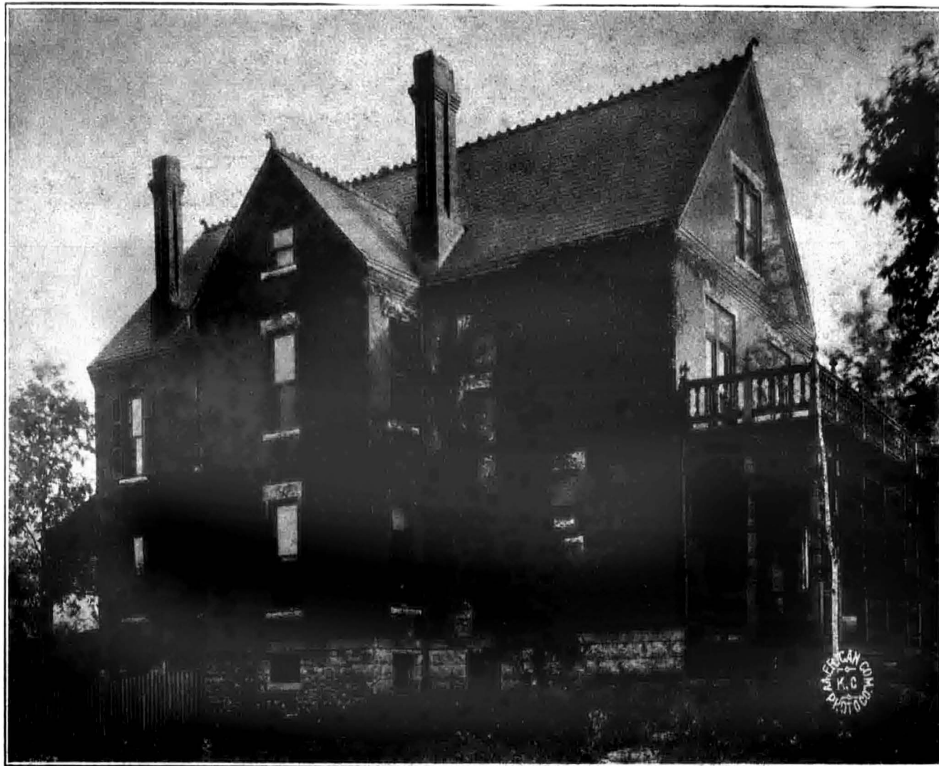
PUBLISHING HOUSE OF THE PENTECOSTAL CHURCH OF THE NAZARENE Located at 2109 Troost Avenue, Kansas City, Missouri

B Y THE action of the last General Assembly of the Pentecostal Church of the Nazarene a Board of Publication was created. This board has purchased a splendid property excellently located in Kansas City, Mo., which is being paid for by our Sunday schools. A part of the plant has already been installed and the church literature is now issued from our own Publishing House.