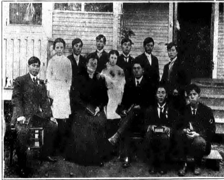
A GROUP TAKEN SHORTLY AFTER THE UPLAND MISSION WORK WAS STARTED

"What can wash away my sins? Nothing but the blood of Jesus."